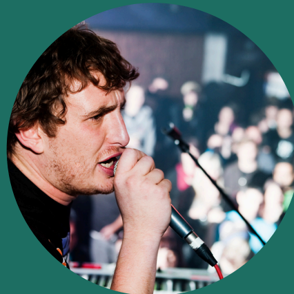
Performance Anxiety How Can We Overcome It?

For a detailed description of the workshops, please visit internationalsingingcamp.com