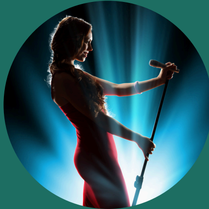
Develop Your Unique Singing Style & Phrasing