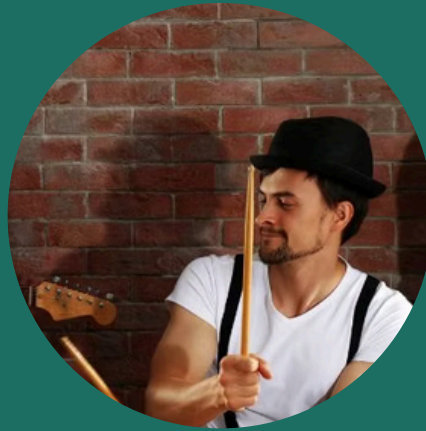
Jazz Rhythm and Interpretation