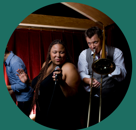
Riffs and Runs