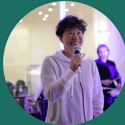
How to Perform at a Jam Session