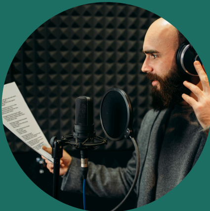
Enunciation The Quirks of the English Language