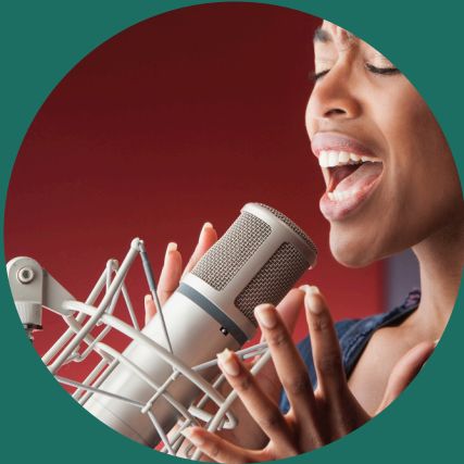
How the Voice Works