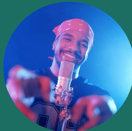
Mindset of a Performer