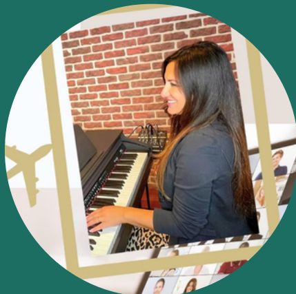
Belcanto Principles: Theory and Practice